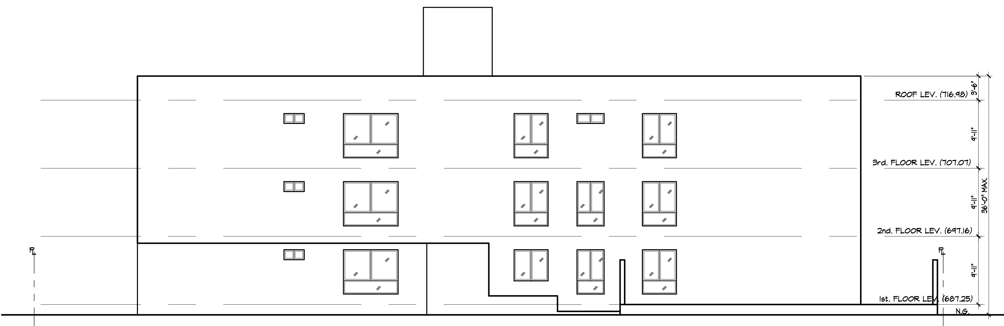
SOUTH ELEVATION SCALE: 1/8" = 1'-0"