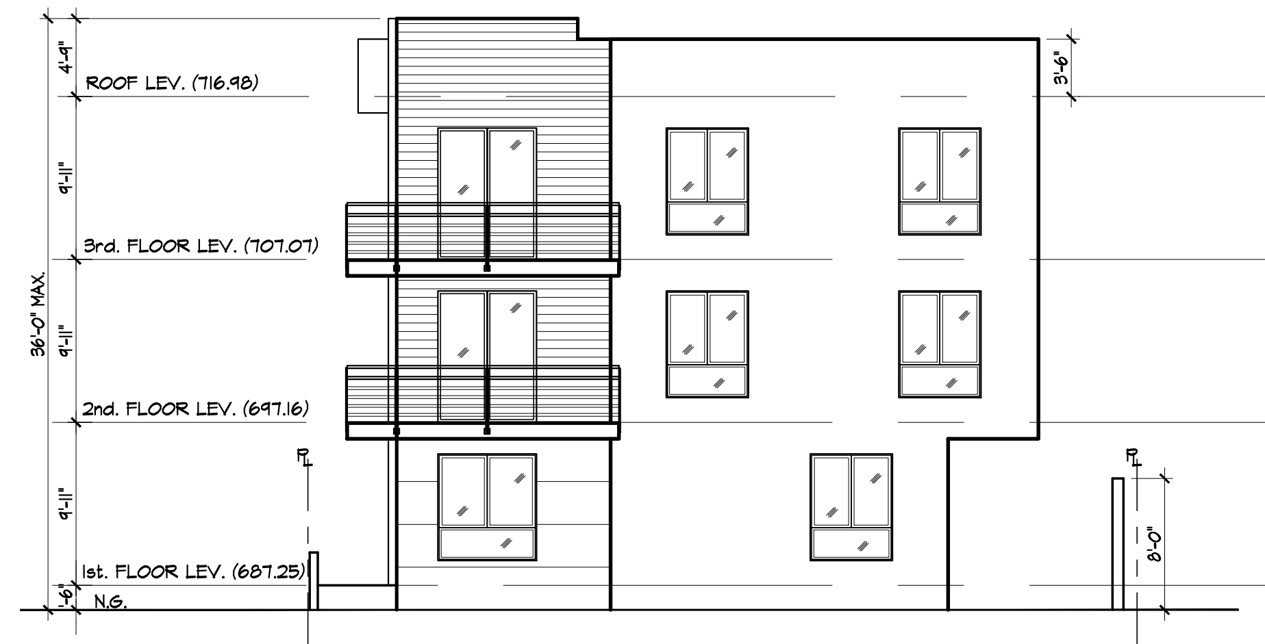
WEST ELEVATION (RADFORD AVE.) SCALE: 1/8" = 1'-0"